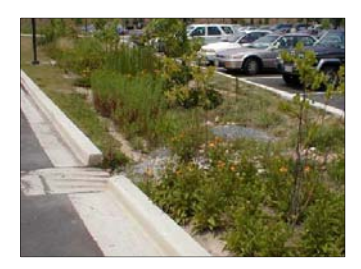
... from a parking lot