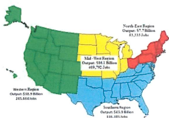
2009 Regional Economic Impacts of Agricultural Exports