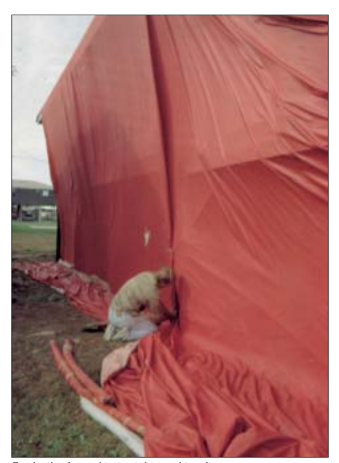
Fumigation is used to treat drywood termites.

Ask for identification confirming that the person offering termite control is certified and licensed by the Texas Structural Pest Control Board. Certified applicators and technicians are required by law to carry identification issued by the Board, and ser-