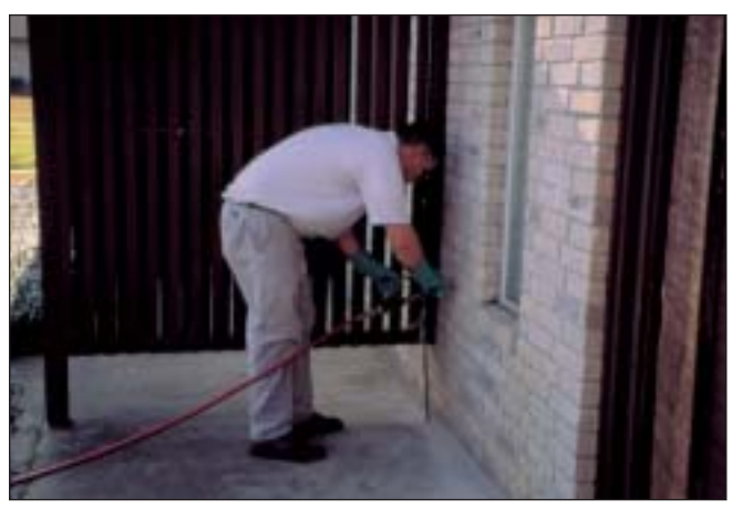
Termiticide is injected in drill holes.

treat chimney bases, dirt filled porches, wall voids and certain sub-slab areas. Foaming is not an alternative treatment for soil-applied drenches and is not suitable for treating the soil directly. Liquid applications should be made first and then foam should be used as a secondary application method.