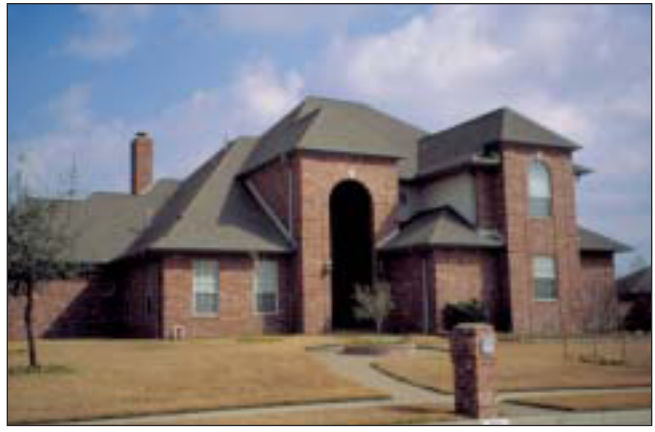
Homes are prime targets for termites.

Some helpful Extension publications termites include, E-368, "Subterranean Termites," E-366, "Drywood Termites," and E-367, "Formosan