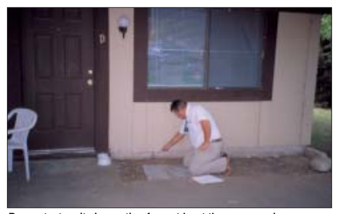
Request a termite inspection from at least three companies.

Consumers shopping for termite control services have more choices than ever. This is good, but it can also be confusing. Control options for subterranean termites include baiting systems, chemical or physical barriers and various combinations of treatments with soil-applied liquid or foam termiticides. For drywood termites, options include removal of infested wood, "drill and treat" procedures using liquid termiticides, and whole house fumigation and heat/cold treat-