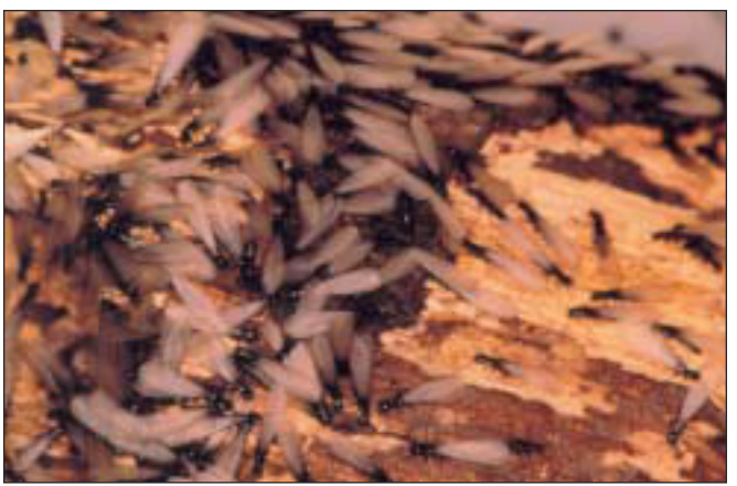
Termites may even begin attacking a home soon after construction.

Subterranean Termites." These publications discuss the identification, biology, behavior and control of termites. If you suspect you have a termite infestation, the following steps will help you select a termite control service: