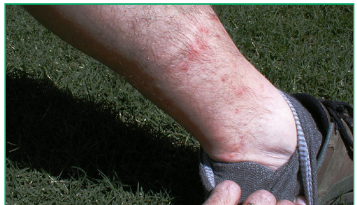
Chigger bites are most common on the lower parts of the body in areas of tight-fitting clothing, such as under socks.

Contrary to common belief, chiggers do not burrow into a host’s skin or suck blood. They pierce the skin with their sharp mouthparts and inject a digestive enzyme, disintegrating skin cells for food. Itching usually begins within 3 to 6 hours after an initial bite, followed by development of reddish areas and sometimes clear pustules or bumps. As the skin becomes red and swollen, it may completely envelop the feeding