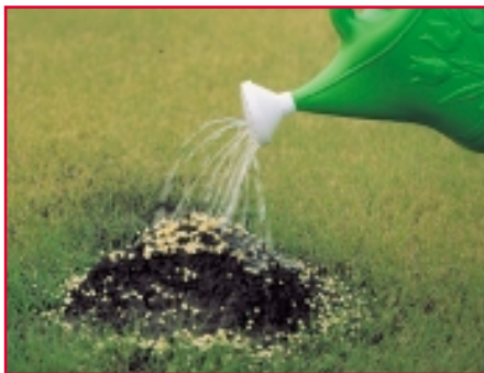
Most granular products contain an insecticide that releases into the soil when drenched with water.