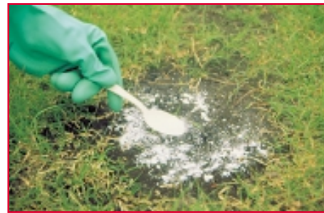
Dry dusts are convenient and easy to apply.