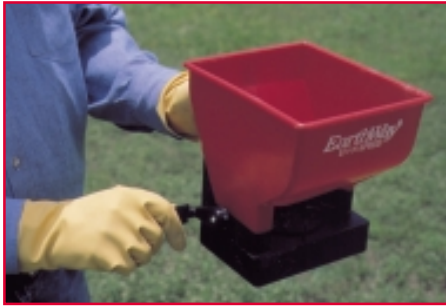
Use a hand-held seed spreader to apply fire ant bait.

face temperature is between 70 and 90 degrees F, May to September in most of Texas. Fall applications work well to reduce fire ant numbers the following spring. During winter, fire ants forage little and rarely pick up baits.