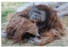
PHOTO SAFARI A Zoo Adventure

Bell Co 4-H Photography Advisory Board Presents: