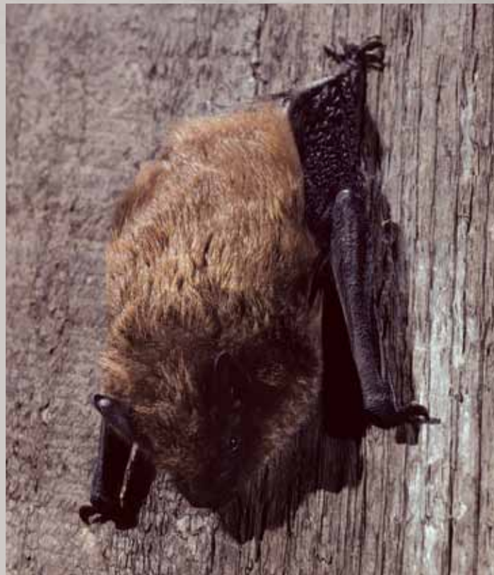
Figure 1. Big brown bat, Eptesicus fuscus .

frequently encountered bat around structures. As the name suggests, this bat has dark brown fur on its back, pale brown fur on the underside, and black skin exposed on the nose, ears, and wings. It is 4 to 5 inches long from nose to tail and weighs \frac{1}{2} to \frac{3}{4} of an ounce. With a wingspan of 12 to 16 inches, big browns appear larger in flight (Figure 2).