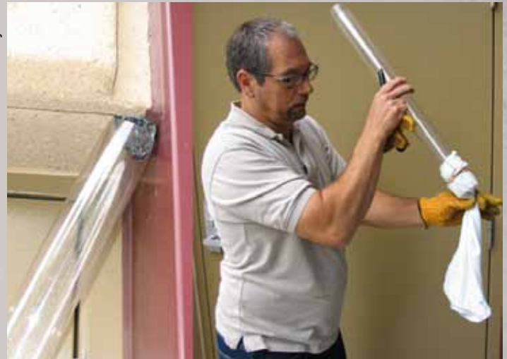
Figure 6. Cloth funnel trap.