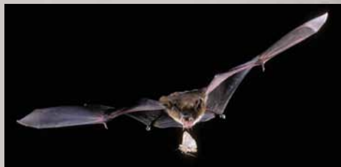
Figure 2. Big brown bat capturing a moth.