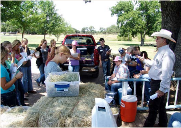
4-H Equine Ambassadors learn how to evaluate hay quality and nutritive value and how to collect hay samples for testing procedures.