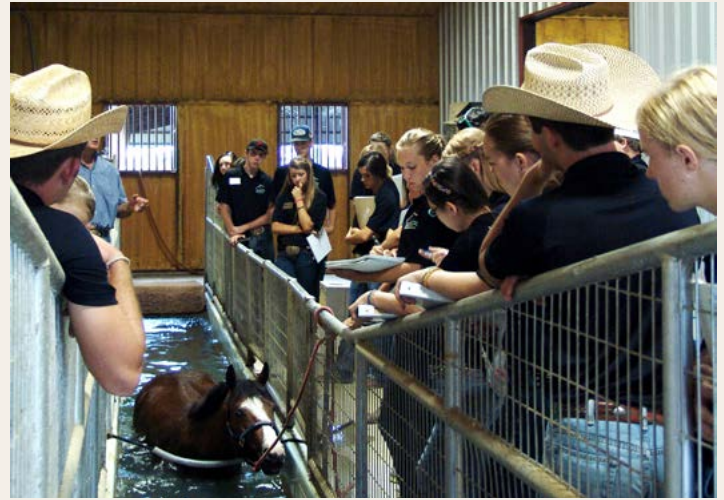
Participants tour the Petska Equine Rehabilitation and Therapy Facility and learn how to work horses on an underwater treadmill.