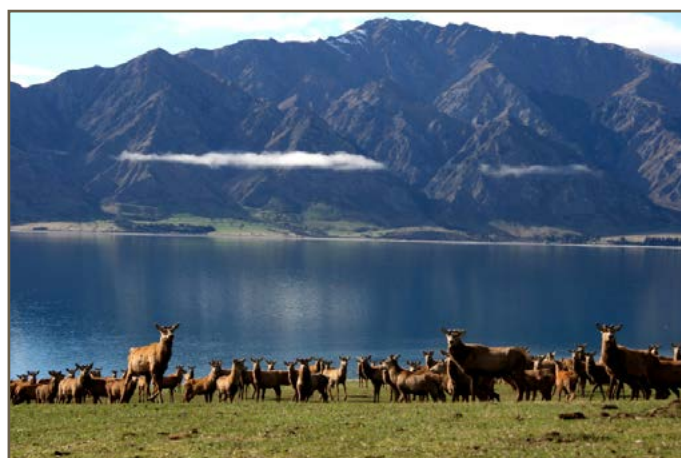
Right , the picturesque view of snow-capped mountains was constant as the group made their way through the countryside. Driving to each destination provided students the opportunity to gain a first-hand understanding of the culture and surroundings of New Zealand.