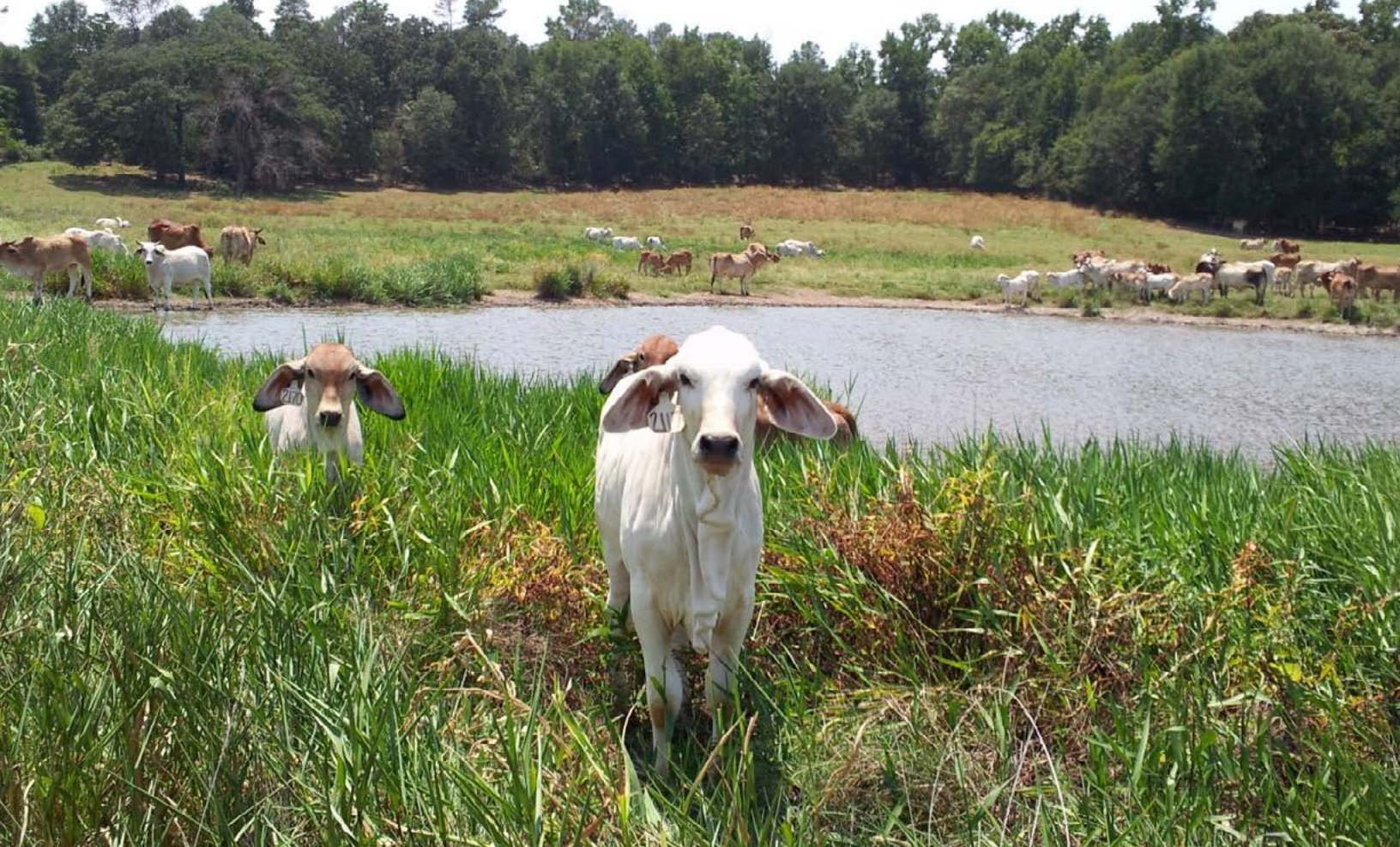
Prenatally stressed suckling calves are more temperamental than their nonstressed herdmates.