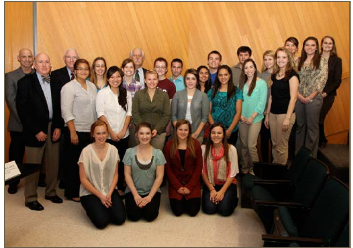
Students participating in the One Health learning community attended a One Health Issues Forum held at Texas A&M University.