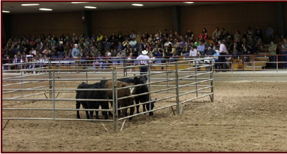
Texas A&M University students learned about cattle welfare issues from several experts recently at an event held at the Pearce Pavilion on campus in College Station.

The event was held on campus at the Pearce Pavilion and coordinated by the Texas A&M department of animal science and Texas AgriLife Extension Service. The Saddle and Sirloin