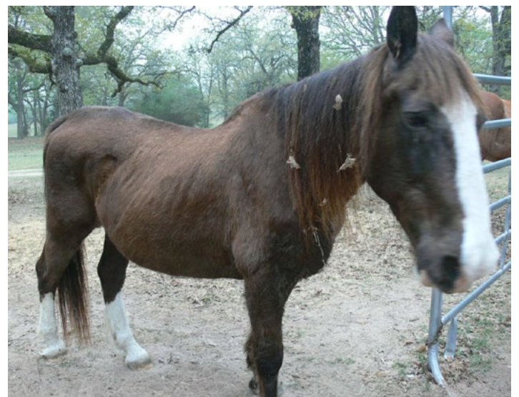
This well-cared-for 25-year-old swaybacked horse can no longer be ridden, so the owner is faced with the dilemma of that to do with the horse. Euthanasia and disposal costs more than $500 and equine shelters and rescues are full. A recent national study estimated the cost for a nonprofit equine organization to maintain one relinquished horse averaged $3,648 per year. (doi:10.2527/jas.2010-3250).