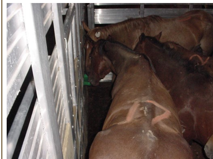
This is an actual commercial shipment of slaughter horses used to test a watering system that was developed with USDA for possible use during extremely long shipments. Miniature body temperature loggers and 12 video cameras were used to record data during transport. These trials resulted in nine scientific journal articles and two review articles from Texas A&M University that provided a basis for the United States and Canada regulations for the commercial transport of horses going to slaughter.

federal law permitted the trade and might supersede state law. However, increasing public concern prompted the Texas Attorney General to examine the 1949 law, who then issued an opinion in August, 2002, that the law applied to the Texas plants. The plants sued and it was not until 2006 that the appeal process ran its course and the Texas plants had to cease