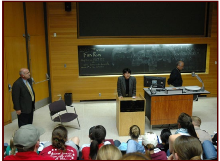
students regarding U.S. production practices and the Japanese market for beef.