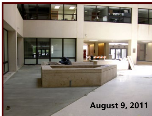
August 9, 2011

For additional information on the atrium project or to support the project, go to http://animalscience.tamu.edu/hesby-atrium .