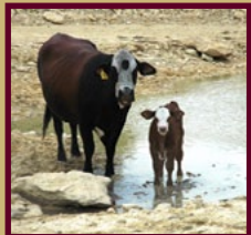
Drought causing concerns for livestock water availability, quality Pages 5-6