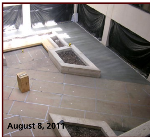
August 8, 2011