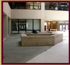
Hesby Student Atrium construction moves forward Page 2