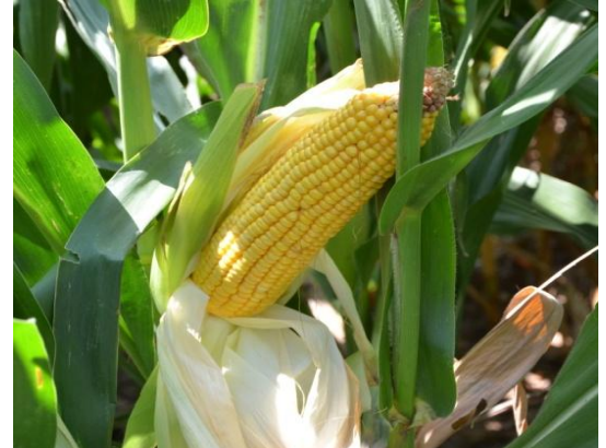
Figure 1: Late season corn ear from EPIC Plot

Efficient Profitable Irrigation in Corn (EPIC) is a results demonstration effort conducted by the Texas AgriLife Extension Service and funded primarily by the North Plains Groundwater Conservation District. The foundation of EPIC is the principle of managing irrigation water for maximized profitability as a means for making optimal economic and agronomic use of the water resource, namely the Ogallala Aquifer (Figure 2). EPIC targets grain corn producers who historically employ efficient irrigation systems and solid agricultural practices in a production strategy focusing on maximized yields (revenue). EPIC is designed to be a multi-year, staged project that helps high-yield grain corn producers maximize their on-farm production potential and reduce applied irrigation water. Potential regional water savings under partial adoption of this practice is estimated to exceed 37,500 acre-feet or 12 Billion gallons annually.