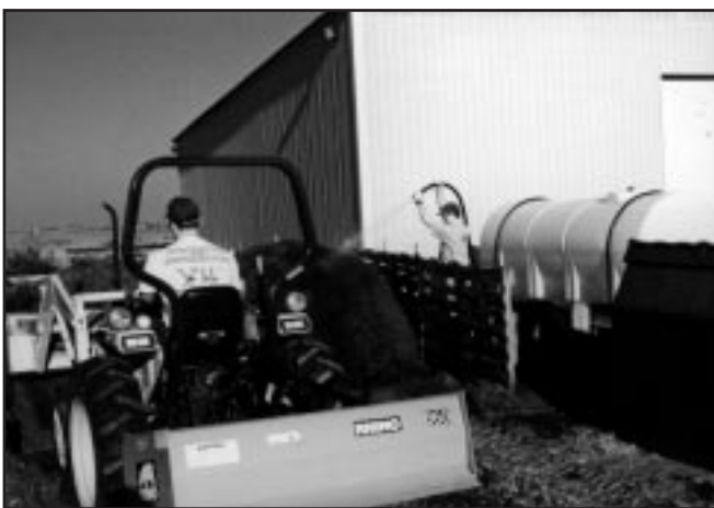
Supplemental water can be sprayed into compost bins from a trailer-mounted tank as the material in each bin is turned and moved.

Generally, the average C:N ratio that optimizes the composting system is 25:1 to 30:1 by weight. Higher C:N ratios cause nitrogen-limited conditions and nitrogen-poor finished compost. Compost that has a low C:N ratio will not stabilize