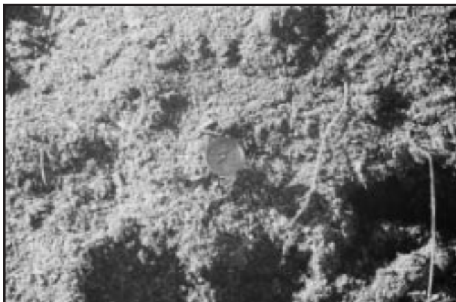
The 139-degree F reading on this long-stemmed thermometer confirms that thermophilic composting is underway.

Measure temperatures at least daily for the first week after the compost has been turned. Then, if temperatures in active bins are in the thermophilic range between 130 degrees and 160 degrees F, the time between measurements may be increased. Temperatures immediately after turning and wetting obviously will be near air temperature, but they should rebound markedly within 48 hours.