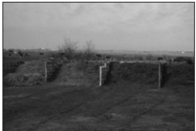
A simple, well-managed composting system is visually appealing and is unlikely to cause water quality problems.

The moisture content of the manure and bedding is normally 50 to 60 percent in the raw state, so additional moisture probably will be unnecessary until the compost is moved to the second or third bin. Have an ample water supply and pressure to moisten the compost as it is turned. Moisture content can drop as low as 25 percent within 4 weeks. To increase the moisture content of compost from 25 percent to 55 percent, add about 20 to 30 gallons of water per 100 cubic feet of compost. For a system in which four bins (1,000 cubic feet each) require additional moisture, approximately 1,200 gallons of water are needed every time the bins are turned. However, the actual amount of water needed will vary substantially depending on the kind of bedding used, the size of the particles in the bedding and other site-specific factors.