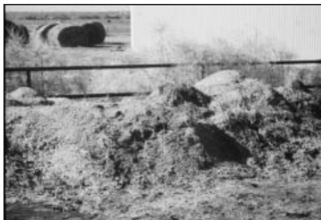
This stockpile of horse manure, straw and wood shavings is unsightly and, if uncontrolled, can pose a threat to water quality in nearby streams and ponds.