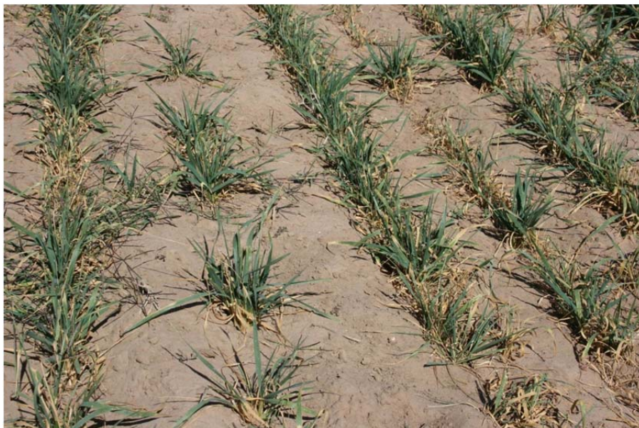
Figure 1. Seedling blight and root rot (bare patch) caused by the fungus Rhizoctonia solani . Other fungi such as Fusarium sp. and Bipolaris sp. can be responsible for similar symptoms.

Some of the fungi that can be found on the glumes and seed can later become a seedling issue when using harvested seed for next years' crop. Some fungi, such as Bipolaris , Fusarium , Pythium and Rhizoctonia can later cause seedling damping off or seedling blights, root and crown rots, leaf spots, and diseases that affect the wheat head. Figure 1 shows the effect of the fungus Rhizoctonia solani on wheat stands by causing seedling damping off or seedling blight early in the season. This fungus causes a root rot which can reduce root size, cause stunting, or even kill younger plants. Rhizoctonia root rot is also known as Rhizoctonia bare patch.