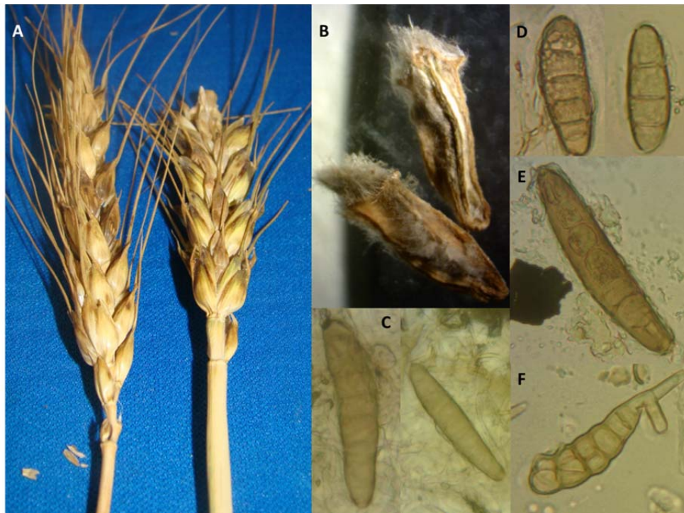
Figure 4. Symptoms and signs observed from the glume of wheat A. Glume discoloration, soft tissue rot, sooty mold. B. Mycelia (fungal growth) of Drechslera sp. growing on seeds. C. Conidia (asexual spore) of Drechslera sp. observed from seeds. D. Conidia of Bipolaris sp. observed from the glume. E. Conidium of Drechslera sp. observed from glume tissue F. Conidium of Alternaria sp. observed from glume tissue.

Yet another sample from the Central Texas Blacklands had similar issues on the wheat head. The glumes were discolored, some rotting was observed and seeds had been infected. Glumes were infected with fungi in the genera Bipolaris , Drechslera , and Alternaria . Any seeds that were infected and rotting were found to be infected by Drechslera sp. (Figure 4)