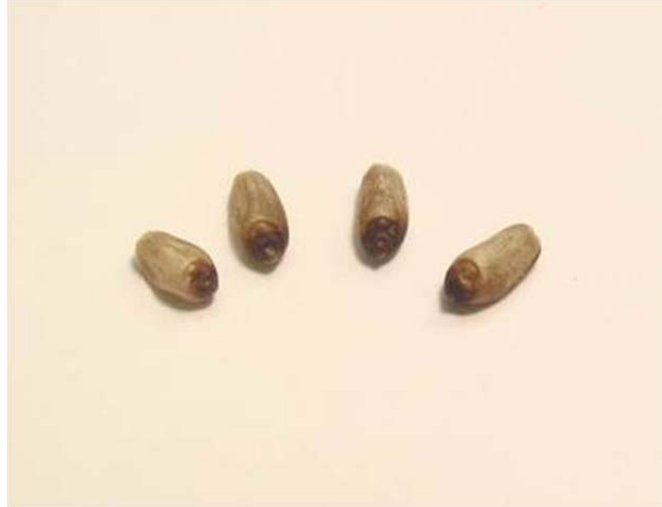
Figure 3. Black point of wheat from samples obtained from the Central Texas Blacklands in 2007.

Yet another sample from the Central Texas Blacklands had similar issues on the wheat head. The glumes were discolored, some rotting was observed and seeds had been infected. Glumes were infected with fungi in the genera Bipolaris , Drechslera , and Alternaria . Any seeds that were infected and rotting were found to be infected by Drechslera sp. (Figure 4)