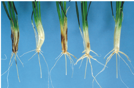
Figure 1. Foot and root rot lesions on wheat seedlings.

Foot and root rots impact winter wheat by reducing plant stand, number of tillers and ultimately yield, and like Take-All, are found in localized patches. Infected plants are first noticed by their stunted appearance. Later in the season plants turn yellow and die.